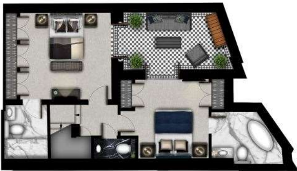
COURT YARD LEVEL