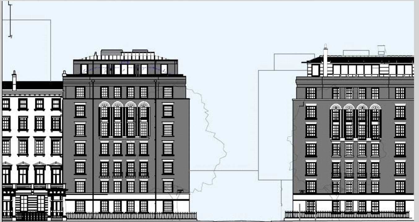
43 Lowndes Square