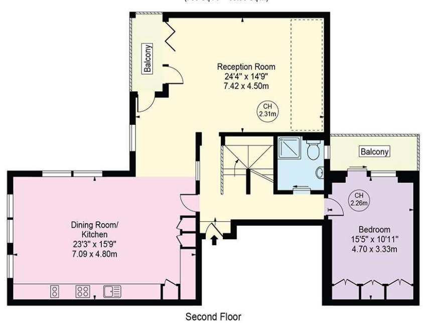
(1089 Sq Ft - 101.17 Sq M)